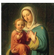
MARY: God's Yes to Man John Paul II, Encyclical Redemptoris Mater Introduction by Joseph Cardinal Ratzinger Commentary by Hans Urs von Balthasar IGNATIUS

BISHOP'S INITIATIVE ON MARRIAGE: "I came so that they might have life and have it more abundantly." Lead your married lives "more abundantly" by participating in a WorldWide Marriage Encounter weekend. The next weekends are: Sept. 15-17, 2017 in Herndon, VA and Oct 27-29, 2017 in Gaithersburg, MD. Early sign up is recommended. For more information visit our website at: RenewMarriage-VANorth.org or contact us at < mailto:wmandbethnickles@hotmail.com > or call: 703-646-1521.