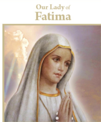
Truth to Inspire Series Audio Stories of the Saints by Quiet Waters